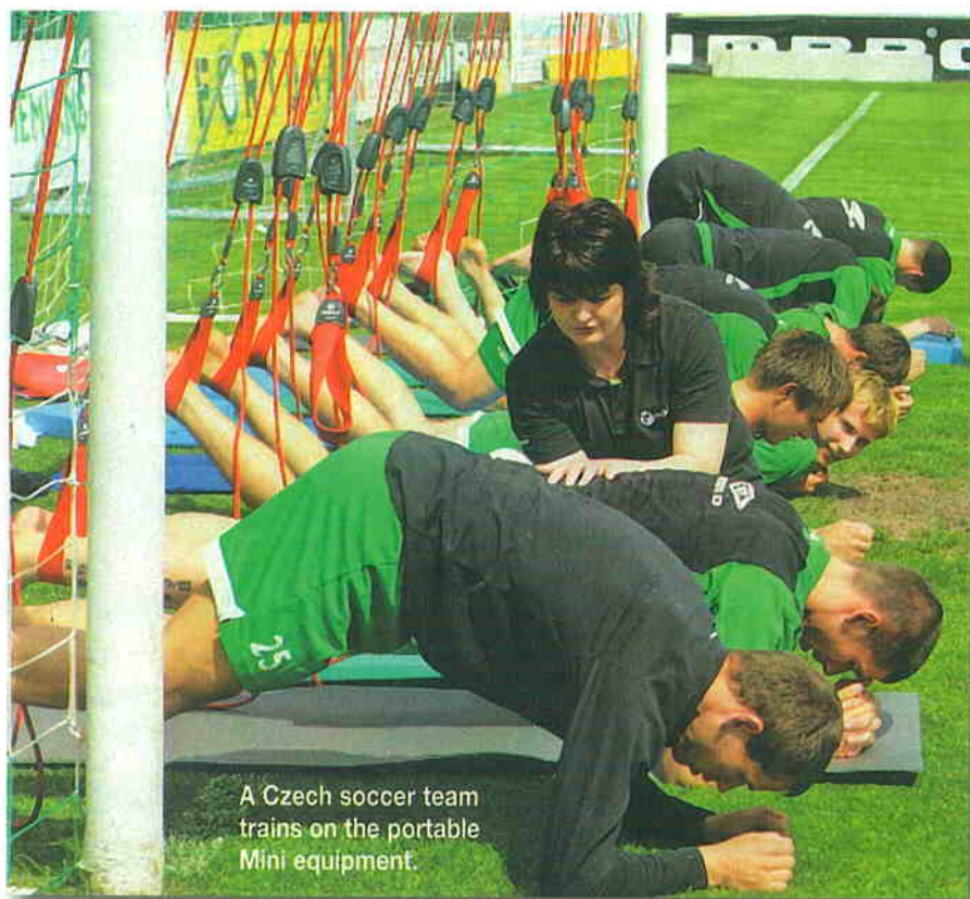
A Czech soccer team trains on the portable Mini equipment.

Even though I didn't leap out of the cords after 15 minutes with new functionality, after just six sessions my performance in training events had improved noticeably. Today I am faster and stronger in running and cycling, and my skating strength and balance have improved. I'm no miracle on ice, but I can feel the subtle difference. By awakening and strengthening key stabilizer muscles in my hips and torso, ActivCore helped me get everything